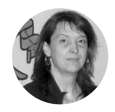
European Project Mgr FTC (Federazione Trentina della Cooperazione)