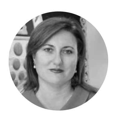
President of Centro Internacional de Investigación sobre Economía Pública, Social y Cooperativa (CIRIEC) Spain