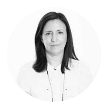
Secondary Education Advisor, expert in entrepreneurial education