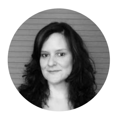
Technical projects on Cooperatives at ILO (International Labour Organisation)